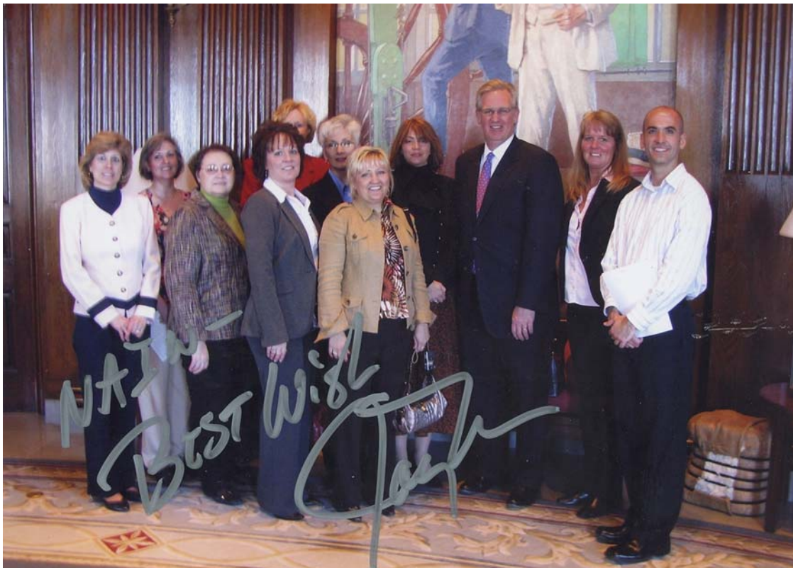
Missouri Council Members with Governor Jay Nixon at the 2009 Trip to Jeff City! Signed "NAIW – Best Wishes Jay Nixon"