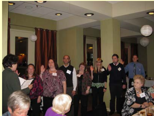
Installation of our new Officers and Board

The 2010 banquet was a big success as we treated our employers to a nice meal and let them know how their support has benefited the community and allowed us to grow as professionals.